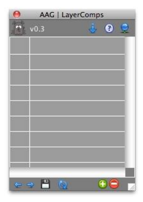
Figure 1. Screenshot of LiveCode

AAG Tools is a set of tools added and used in LiveCode to produce a particular action. LayerComps allows the user to record straight and clear controls and help to switch cases when changed. It is also used in creating various initial layouts to show them to the client and can be easily replaced.