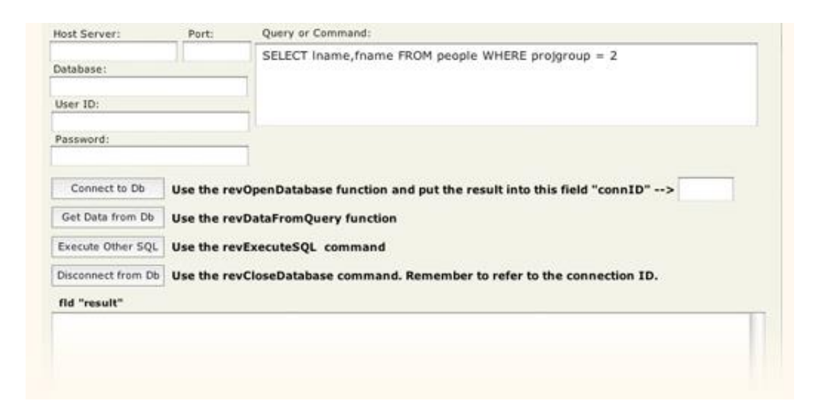
Figure 3. Database options in LiveCode

There are different fields that contain information that creates a connection in the database. There is also a field that can enter SQL data to be executed within the program. Live Code contains a lot of commands that help the developer interact with the databases. There are a lot of tools that work with databases and keep them working. It is hard work for people who use it for the first time there are ways to help learn from them: The first is to open the database and is done by calling the function. When the function is written correctly, the stack is connected to the server. The ID number must be stored in a safe place. The next step is to close the database connection because if the databases are not closed the operation may fail. You must close the database to make sure the contact is valid by calling the function. The next step is to bring the data to LiveCode. The easiest way to do this is to rev Data from Query that sends a SQL query to the data room and returns it. The last step is to execute SQL commands. When the operation succeeds, the function will contain an integer and if an error occurs, an error message will be displayed. In this article will help me to how to connect database with LiveCode. (Jacky, 2016).