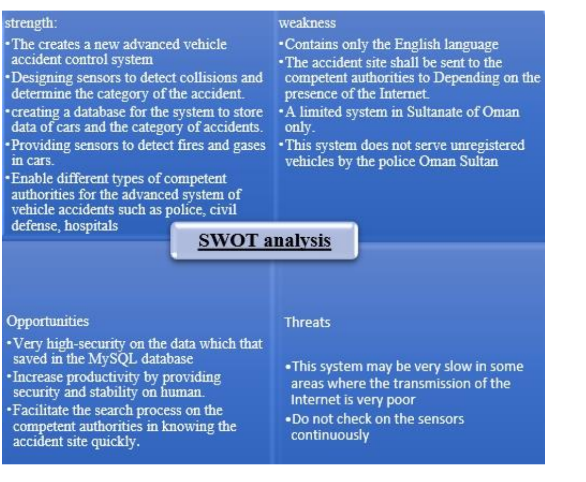
Figure 1. SWOT analysis