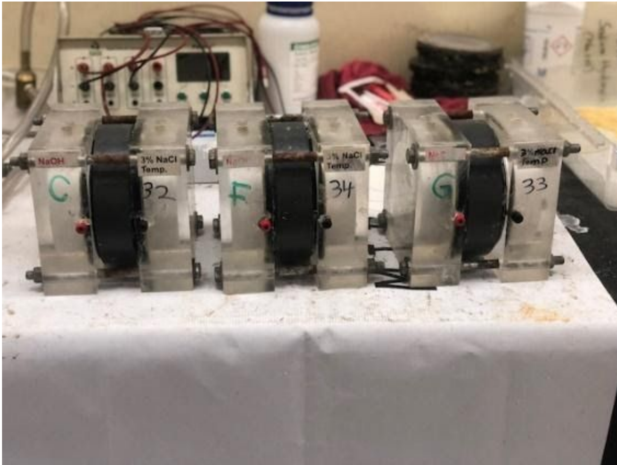
Figure 3. Preparation of the cells