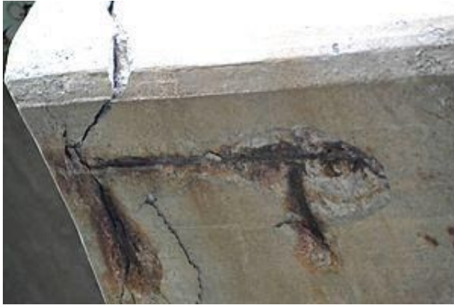
Figure 1. The effect of corrosion on concrete