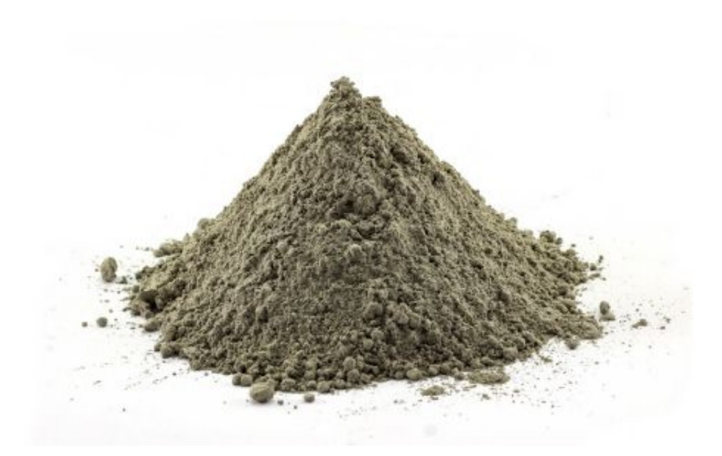
Figure 2. Cement