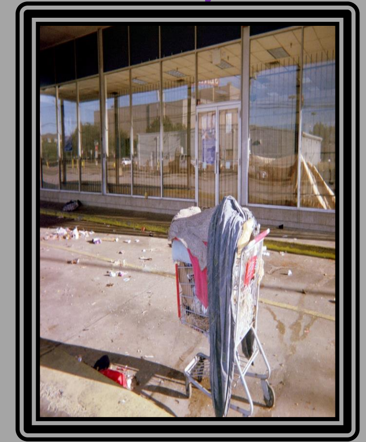
Mi Casa, Su Casa

Store up all your possessions & follow me. The Security & Transportability of a shopping cart; a staple in every homeless community; Metal structure represents strength & endurance. But the wheels, a continuous cycle of despair, long suffering, and inadequate healthcare.