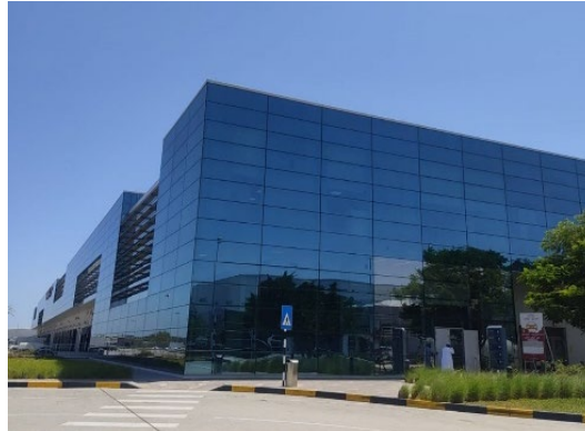
Figure 1. Transom SATS Cargo Building

There is a significant portion of perishable and temperature controlled perishable products. Hence there is a requirement of an extremely cold chain supportive handling system. Dangerous goods and radioactive material are also an important part of the import/export assignments coming into Muscat. This calls for highly secure systems to be used in the Cargo complex.