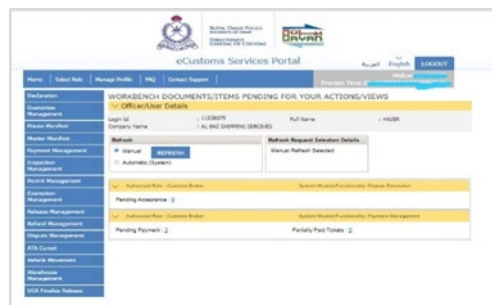
Figure 4. Al-Bayan System