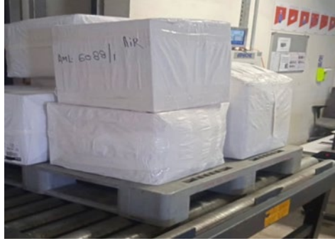
Figure 5. Receiving shipment.

Transom SATS plans on growing a sustainable business and at the same time remain financially strong. They have invested heavily in technology to deliver the best of services to its customers. Transom SATS plans to offer tailor made services for niche markets and for meeting the needs of its customers. The company aims to offer and maintain services in the field of Air Cargo in the Sultanate.