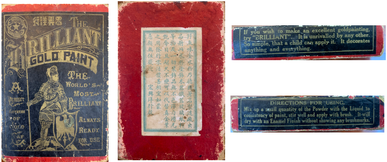
Figure 1. Gold paint box from Wang Hing factory

product. This specific product was made in Germany and sold in Guangzhou as merchandise. The first phrase “仔鱼” on the back of the paintbox translates to “double fish” which is the brand name of the gold paint. In addition, the expression of using “孖” as double is a typical Cantonese usage which helped to localize the product. Since there was little promotion of the official Qing Mandarin, or guanhua , to the common people, Guangzhou merchants used Cantonese phrases and grammar on their labels.