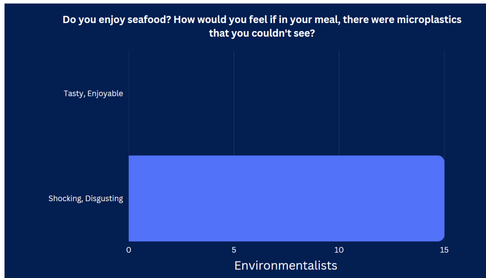
Figure 2. Interviews with 15 environmentalists, their opinion about microplastics in food.

The intricate relationship between microplastics and human health has garnered significant attention in recent years. Researchers have embarked on a collective endeavor to decipher the potential implications of microplastic exposure on human wellbeing. By delving into exposure pathways, ingestion through food and water, and potential health risks, scientific investigations offer valuable insights that underpin this multifaceted topic.