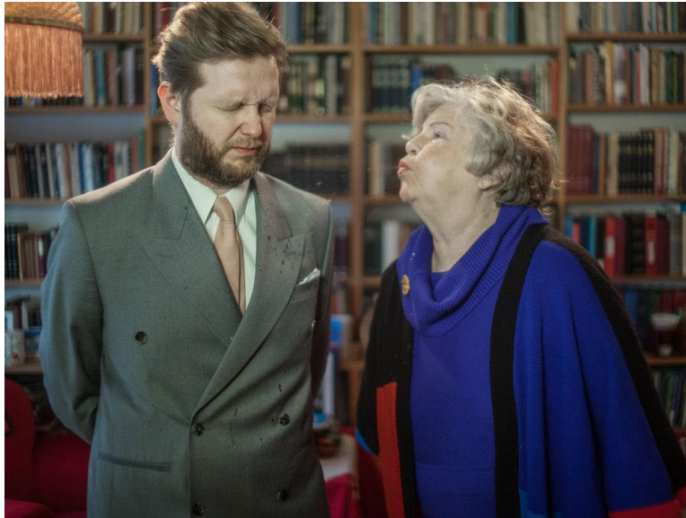
Figure 7: Me and My Mother , ongoing, Ragnar Kjartansson.

Consistent with the theme of performance, much of Kjartansson’s pieces revolve around music and video that are then exhibited in specific ways for audience viewing. Sumarnótt (Death is Elsewhere) features two sets of twins circling around a central camera repeating the same musical phrase in a field, “in the dark/in the dark/my love/my love/by the stream/by the stream/my love/my love/death is elsewhere”. The song contains a hypnotic, haunting repetition with no beginning or end. Beyond the repetition, there are small changes in phrasing, movement, and overall performance. The theme of “same yet different” is also exemplified in Kjartansson’s intentional casting of twins. Twins are mirrors of each other: identical in some ways yet different in many other ways.