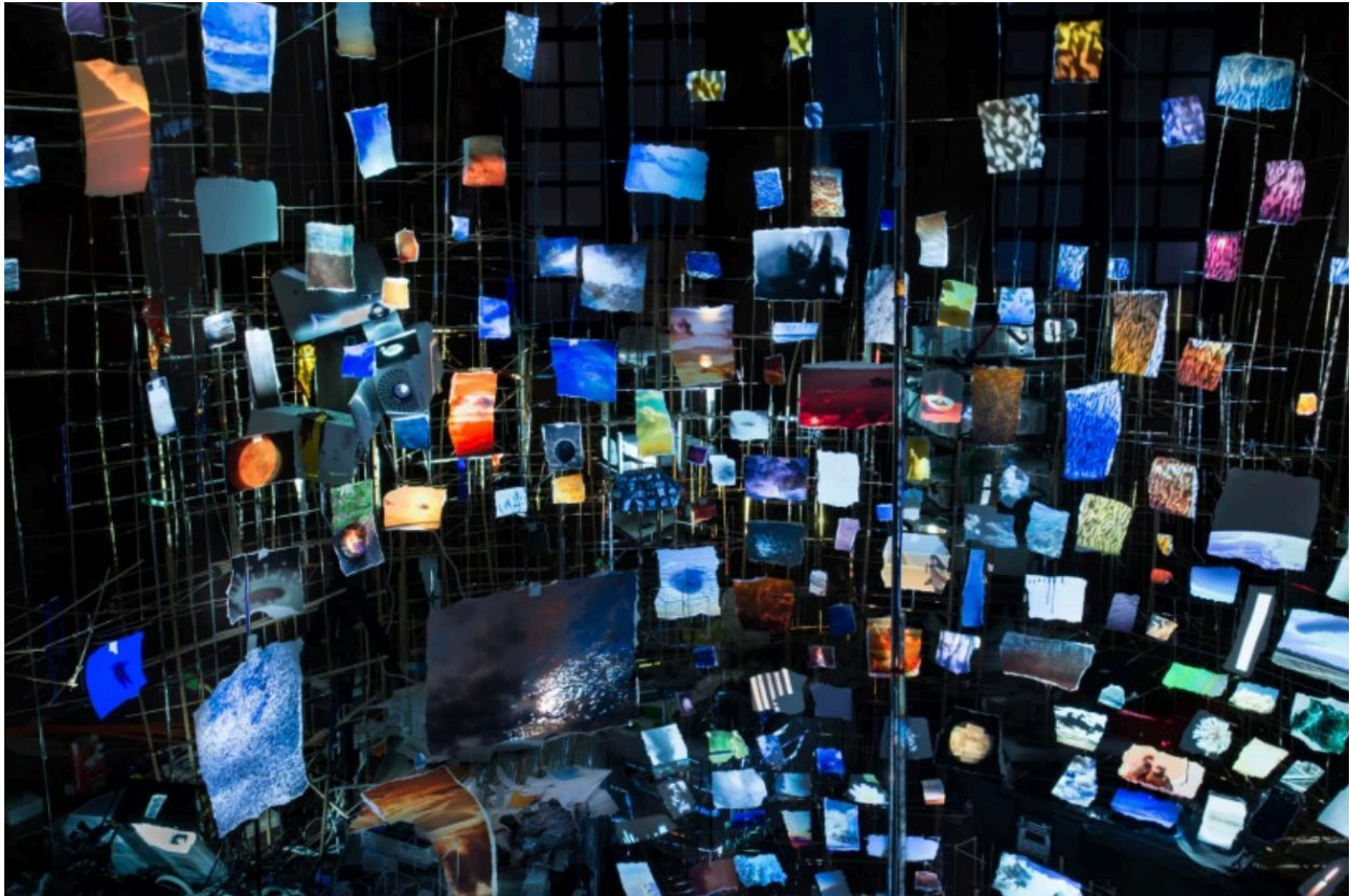
Figure 2: Centrifuge, 2017, Sarah Sze.

In the same vein, there is a force of attraction between the piece and its viewer in Sze's piece, Timekeeper . In line with its name, the installation addresses the concept of memory most directly. She speaks about her multimedia work and the importance of art in Guggenheim's collection, calling every exhibition a "timekeeper". Furthermore, art is "a way to have a conversation over time. The show becomes almost like a forensic site for an installation or an archeology site for, you know, a series of works. So you see the process of making—that evidence of that process left over... Live in the space." 2 The installation evolves from simply an art piece into an experience of discovery for the viewer. Fragments are left by the artist and are simultaneously being put together and pulled apart in real time. Using flickering lights and images, Sze plays with memory and the idea of the "afterimages" saved in our minds. Each puzzle piece facet of the exhibit seems to fit together yet remain isolated and separate. Timekeeper barrages viewers with images and information, each of them tethering between cohesive and incoherent. Some images are familiar within personal memory, but Sze recontextualizes them within her piece, provoking a sense of wonder and curiosity for the viewer. Through her own collection of images, Sze evokes many of the viewers' personal images and recollections, allowing them to create personal meaning in reference to a singular piece of art.