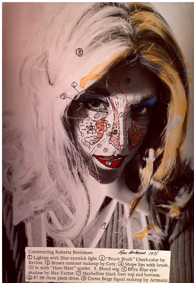
Figure 5: Roberta's Construction Chart 1, 1975, archival digital print and dye transfer, 58.4 x 43.2 cm, Lynn Hershman Leeson.

Ambitiously, Hershman Leeson pursued a performance project in which she acted as the fictional character Roberta Breitmore for five years. After the initial "act" of arriving in San Francisco, Roberta Breitmore performed real-life activities such as creating a bank account, visiting psychiatrists, renting an apartment, and more. In creating such a character, Hershman Leeson provided Roberta Breitmore with her own clothing, signature makeup, unique walk, speaking mannerisms, gestures, and handwriting. Through this project, Hershman Leeson constructs a new identity. She turns a character outward rather than inwards, questioning how one must perform in society. Rather than build a character based on internal meditation, Roberta Breitmore is a collection of societal input as to what a woman should be.