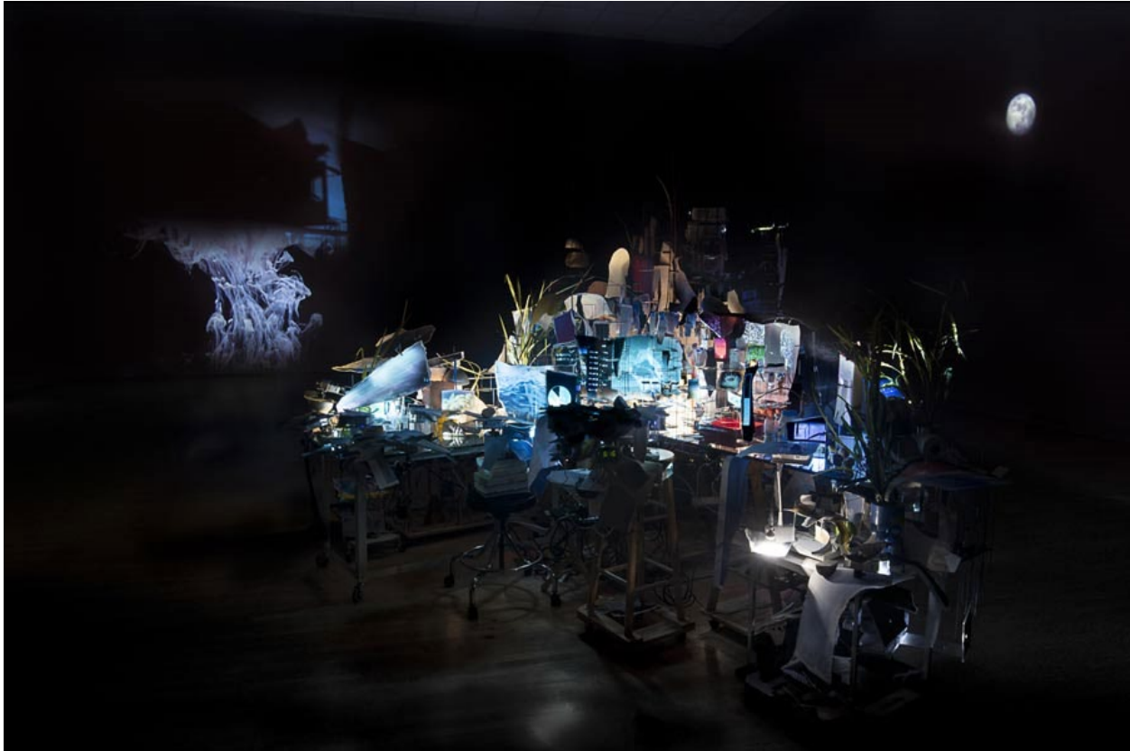
Figure 3: Timekeeper, 2016, Sarah Sze.

Sze's art is intimate; it allows viewers to become part of the work. Specifically in Timekeeper , Sze invites viewers into her workspace by placing her desk in the middle of the exhibition. It becomes an immersive experience where viewers are able to walk, observe, and discover facets of the piece. One unique aspect of Sze's exhibition is its ability to create and invite viewers into a new space. Sze's work consistently contains a sense of discovery, balancing awe and wonder. The created liminal space creates opportunities for viewers to puzzle piece their own meaning from the fragments provided by the exhibit. The tension between completion and destruction within Sze's pieces speaks to the fragility of memory. This sense of discovery paired with implicit themes of memory and mind simulate the navigation of one's psyche. Sze's artwork imitates the inner workings of a mind with stored free-flowing images and memories.