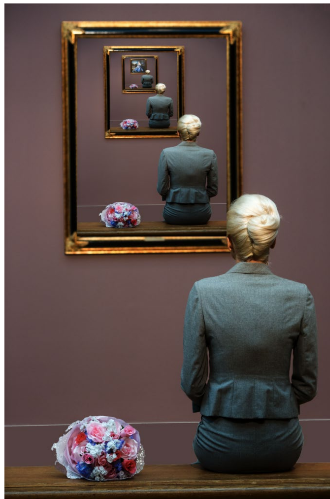
Figure 4: VertiGhost , 2017 (still), Lynn Hershman Leeson.

Hershman Leeson's 2017 exhibit, VertiGhost , combines these objectives and makes a statement about identity, performance, obsession, and truth. Inspired by Vertigo , directed by Alfred Hitchcock, Hershman Leeson reinterprets the movie by filming her own version of a core scene that takes place at the Legion of Honor. Along with the recreation of the movie scene, the exhibit includes dialogue regarding the authenticity of Amedeo Modigliani's painting in the Museum's collection and interviews about the construction of realities in life and art. 3 The movie Vertigo deals with the denial of truth as the main character, ironically an ex-detective, willfully allows fiction and reality to be blurred as his intent for pursuing truth falters. VertiGhost is a response to the film, pressuring the same idea of authenticity. It questions the construction of an identity, of what "creates" a person. How does one perform or conform? In modern society, false information is readily spread, and authenticity is often questioned. The question of truth becomes more and more nuanced.