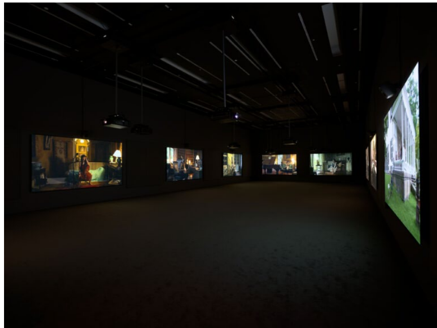
Figure 9: The Visitors , 2012 (installation view, SFMOMA; 2022), Ragnar Kjartansson. Jointly owned by the San Francisco Museum of Modern Art and The Museum of Modern Art, New York, acquired through the generosity of Mimi Haas and Helen and Charles Schwab.