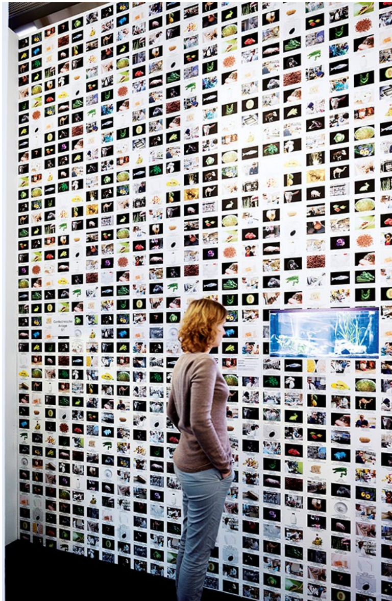
Figure 6: Wallpaper from The Infinity Engine , 2014, archival digital print, variable dimensions, Lynn Hershman Leeson. Found on website lynnhershman.com

Identity is simply who or what a person or thing is; however, there are many dimensions of identity. There are labels we give ourselves, and there are labels that are put upon us by others. Fluid with time, these labels are intangible and subject to change. However, your undeniable identity lies in one's own biology. Infinity Engine , exhibited in 2014, explores the cross-section of technology and identity. In collaboration with well-known scientists, Hershman Leeson created a functional replica of a genetics lab. Rooms fill with images of hybrid crops and animals. Additionally, viewers are able to interact in the "capture room", where they are able to uncover their DNA origins through reverse facial recognition software.