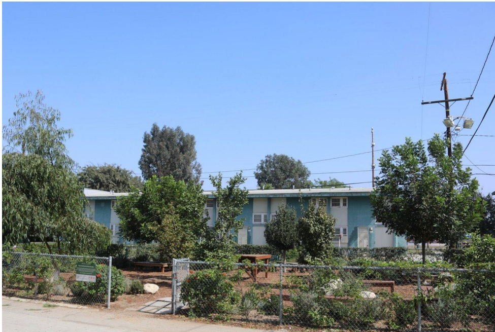
Fig 3b. Imperial Courts Unity Garden in May 2022.

In an era where environmental challenges are mounting for the global community, and even more so for vulnerable populations, environmental initiatives demonstrate the strength of community-driven efforts in addressing ecological issues. By supporting these organizations or increasing the growth of these initiatives, there is great optimism for providing healthy environments for all. Such involvement can lead to a ripple effect of environmental consciousness, inspiring more city-level sustainable practices that can prioritize conservation efforts in policies as seen in Copenhagen and London.