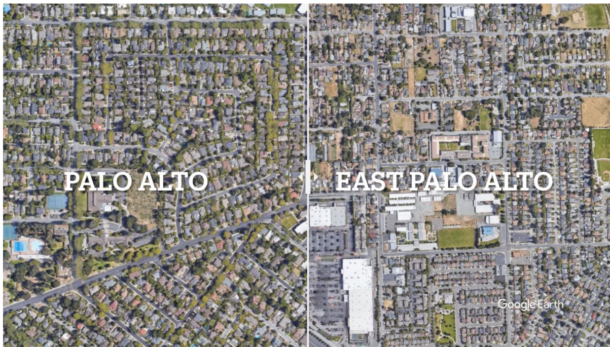
Fig 1. Comparison of Tree Canopy shown in Palo Alto and East Palo Alto.