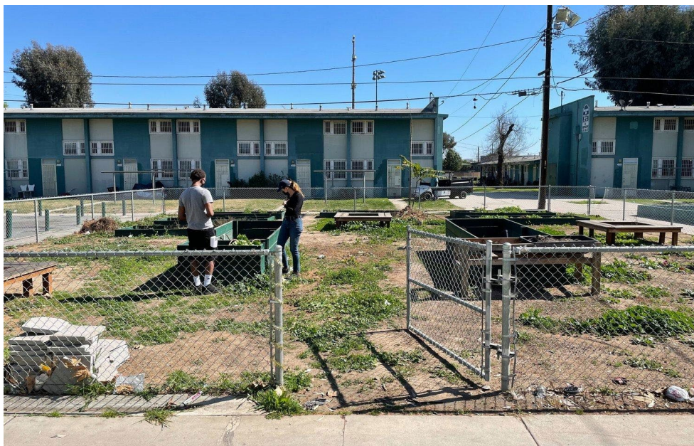
Fig 3a. Imperial Courts Unity Garden in March 2021.

Neighborhood Gardens Trust and Green Spaces LA demonstrate the capability of non-profit organizations in championing the preservation of local greenspaces. Their efforts have helped enrich the lives of residents of all socioeconomic statuses and inspire a sense of connection to the natural world. These initiatives represent a powerful step towards ensuring that nature is accessible and plentiful, a factor that will greatly benefit the well-being of all communities.