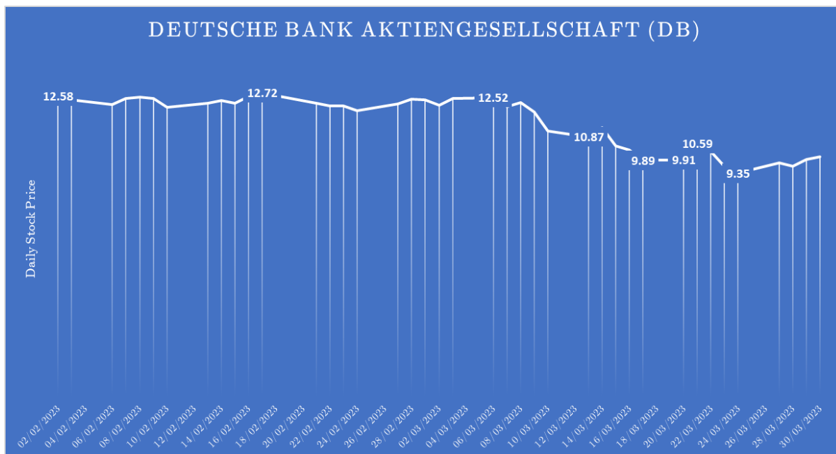
Figure 4: Deutsche Bank Aktiengesellschaft (DB) daily closing prices at NYSE from February 2nd 2023 to March 31st 2023.

Deutsche Bank has faced a substantial decade-long decline, resulting in considerable reputational damage, a case similar to that of Credit Suisse. Its stock price has plummeted by 65%, total assets have contracted by a third, revenues have dipped by 25%, dividends now stand 73% below the 2012 level, and fines totaling at least 14 billion euros have been paid (Storbeck, 2022). Concurrently, as SVB and other US banks, along with Credit Suisse, faltered, a contagion effect reached Deutsche Bank, Germany's largest lender. Parallel to Credit Suisse, Deutsche wasn't plagued by liquidity issues but was mired in various scandals, encompassing money laundering, tax fraud, and corporate espionage. In one instance, a German bank engaged in a multibillion-euro tax evasion scheme called "cum-ex," entailing an impending penalty of nearly 60 million euros, shared with Bank of New York Mellon and Germany's Warburg Group (Reuters, 2022). Another notable case was the 2017 money laundering transactions that transpired under the bank's oversight, enabling sham trades to move $10 billion out of Russia through ghost entities. For this lapse, US and UK authorities fined the bank $630 million for inadequate controls (Saudelli, 2019). To remedy the situation, the board appointed Christian Sewing as CEO in 2018 to rectify the bank's tarnished reputation (Sims, 2022).