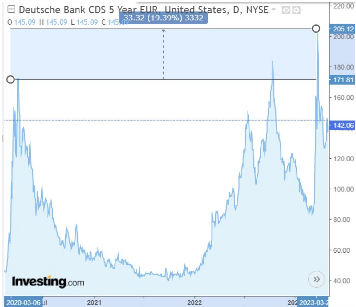
Figure 5: Deutsche Bank Aktiengesellschaft (DB) 5-Year EUR CDS daily closing prices at NYSE from February 2020 to April 2023.

DB's five-year credit default swaps (CDS) (figure 5) surged to 171.81 bps in March 2020 during the pandemic's peak and have now escalated to 205.12 bps as of March 24th. This marks a 145% increase in Deutsche Bank's insurance risk from March 6, 2020, to March 24th, 2023, reflecting investors' heightened risk aversion in the worldwide and European financial markets.