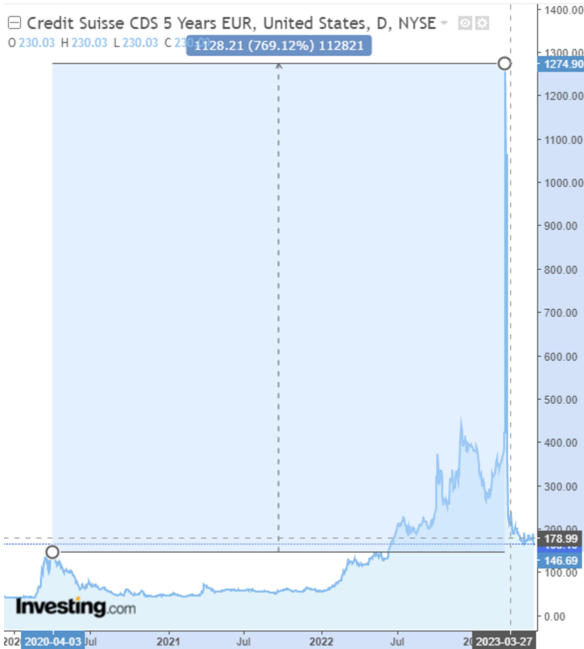
Figure 3: Credit Suisse 5-Year EUR CDS daily closing prices at NYSE from March 2020 to May 2023.

Regarding Credit Suisse's five-year credit default swaps (CDS), the pinnacle hit an extraordinary 1274.9 bps on March 27th, 2023, as observed in figure 3, just before its emergency merger with UBS. Credit Suisse's insurance risk surged by a staggering 769.12% from April 3, 2020, to March 27th, 2023, reflecting the perceived risk of losses on their unsecured debt.