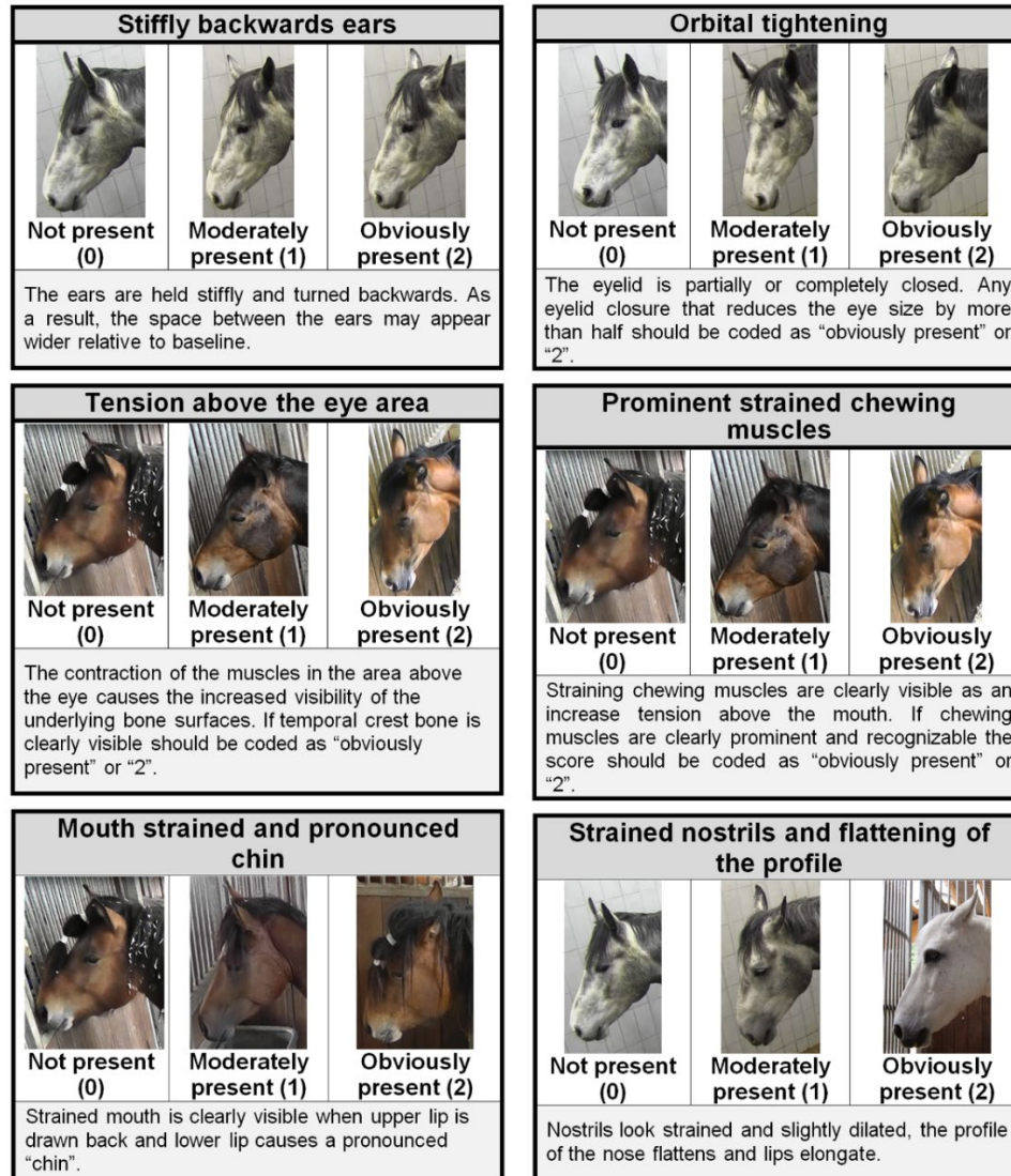
Figure 3. Behaviors on the HGS (Horse Grimace Pain Scale), also known as FAUs or facial action units, are seen above. Each behavior is rated on a scale of 0 to 2, 0 being not present, 1 being moderately present, and 2 being obviously present. The maximum possible score overall would be 12. (Dalla Costa et al., 2014).