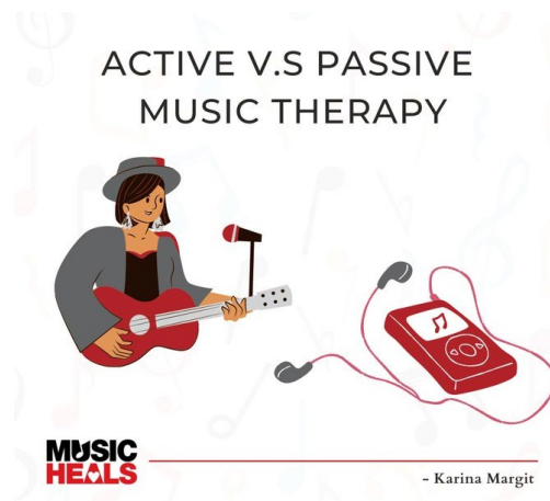
Figure 1. Direct Difference between Active MT and Passive MT.

Down Syndrome (DS) 1 , which is caused by the presence of an extra copy of human chromosome 21, is a genetic disorder that affects approximately 1 in every 700 births, making it the most common chromosomal disorder. DS is characterized by intellectual disability, physical growth delays, distinctive facial features, as well as difficulties in socialization (Desai, 1997; Malak et al., 2015). Children with DS often face challenges that impact their social skills and their ability to communicate effectively with others. Traditional therapeutic interventions for children with DS often focus on speech and language development, occupational therapy, and physical therapy (Davis, 2008; Ruiz-González et al., 2019). While these interventions are essential, they may not fully address the socialization needs of children with DS. Therefore, there is a need to explore alternative therapeutic approaches that can effectively promote socialization skills in this population. This paper will explore the use of active music therapy as a means of promoting socialization development in children under 12 with DS.