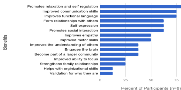
Figure 2. Percentage of Benefits Discussed. This graph shows the percentage of people who identified a certain benefit of music intervention.

Main benefits were arranged into a histogram in order to identify benefits that were discussed most often (Figure 2). ‘Improved communication skills’, ‘Form relationships with others’, ‘Promotes social interaction’, and ‘Improves empathy’ were all above 50% and all relate to the ‘Social skills’ needs of students with ASD (Figure 1). ‘Promotes relaxation and self-regulation’ was the most discussed benefit with 7 (n=8) participants (87.5%) identifying this as a benefit. ‘Improved functional language’, ‘Self-expression’, and ‘Motor skills’ were all identified by at least 50% of respondents. These three benefits directly relate to the ‘Expression of thoughts’, ‘Language’, and ‘Motor skills’ needs of students with ASD (Figure 1).