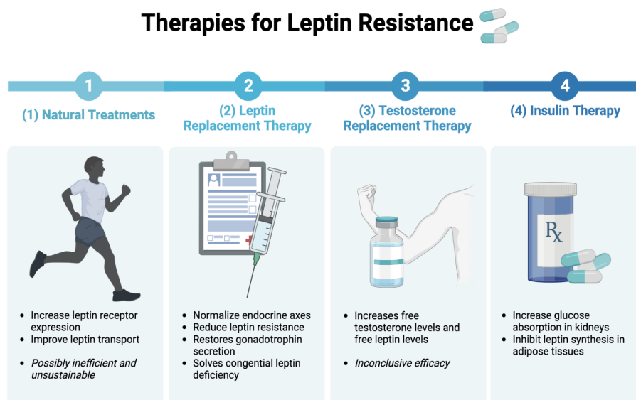
Figure 2. Therapies for leptin resistance.