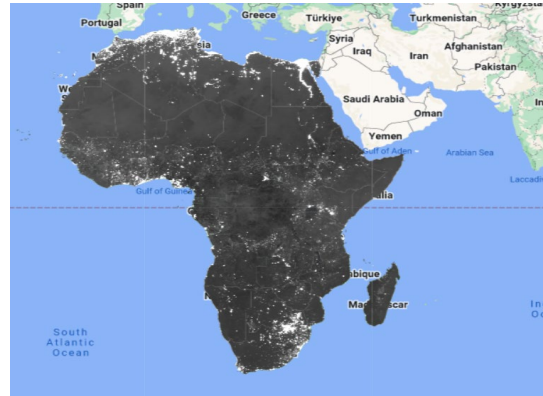
Figure 1. VIIRS-recorded NTL in Africa (2021).