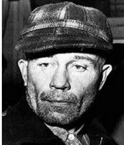
Figure 2.