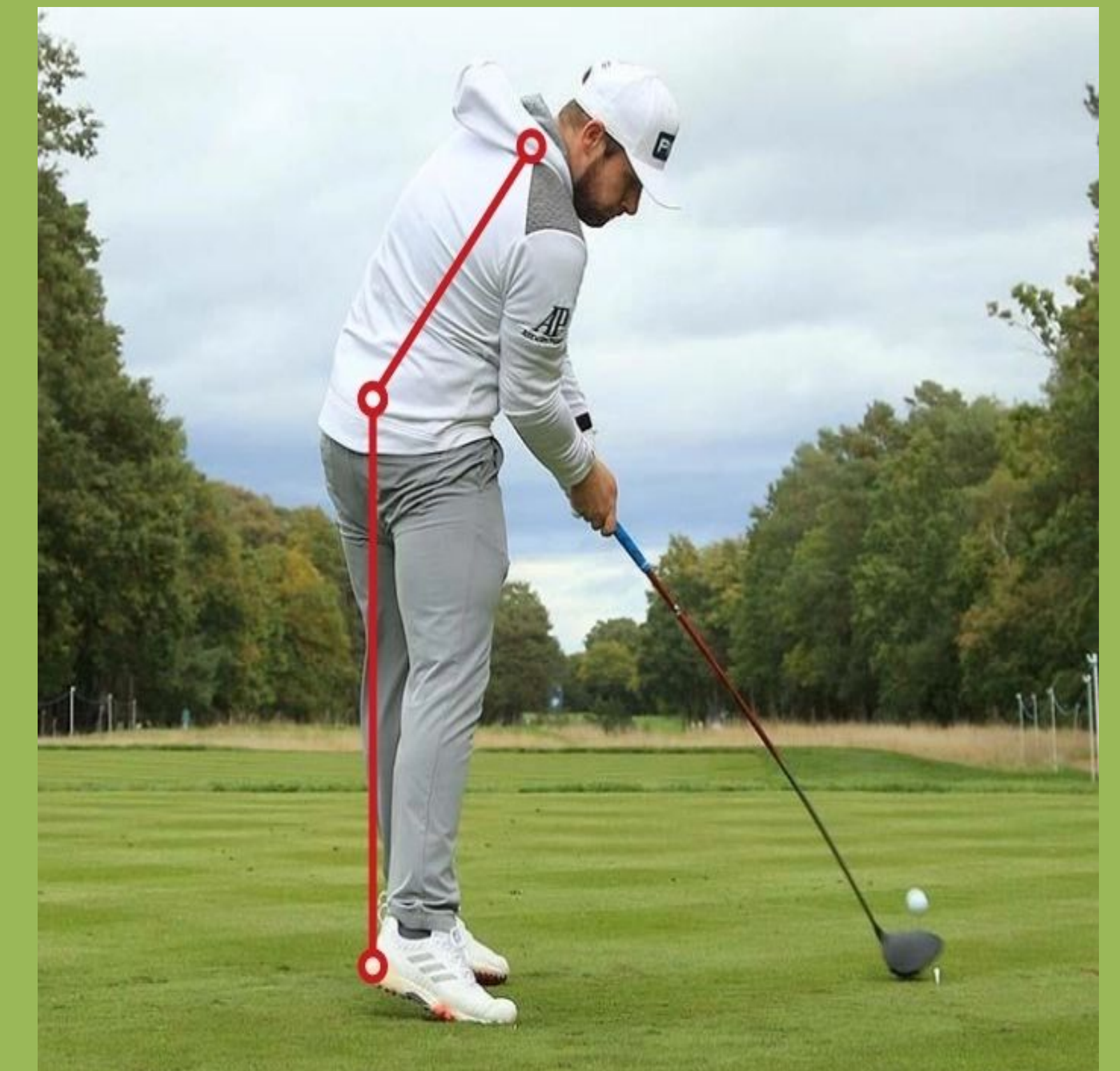
Spine angle of a golf player