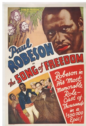
Figure 1. The Song of Freedom Movie Poster with a Darkened Paul Robeson (Song of Freedom Inc., 1936)

To understand colorism within Black sitcoms, it is essential to understand the history of Black representation as a whole. Up until the second half of the 20th century, the overwhelming majority of people presented in the media were White. The few times that African-Americans were casted in Hollywood for significant roles, it would predominantly be lighter-skinned actors as their ability to “pass” as White people helped them be seen as more versatile and relatable. Conversely, darker skinned Black actors’ inability to “pass” meant they were relegated to portraying negative stereotypes (Farrow & Smith, 2019; Freyberg, 2004). Some studios even darkened Black actors' skin to better help them sell the stereotype, such as the case with Paul Robeson in his role for The Song of Freedom (showcased in Figure 1 ), a movie designed to make Black people appear ‘uncivilized’ and ‘comical’ (Farrow & Smith, 2019).