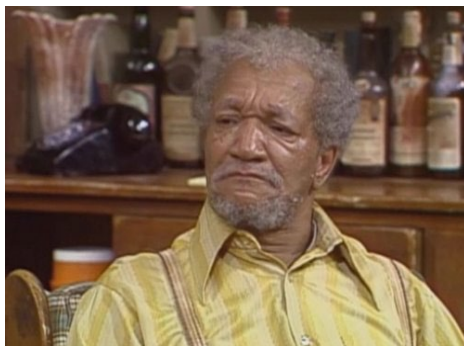
Figure 10. Fred from Sanford and Son (Lear & Yorkin, 1972 - 1977)