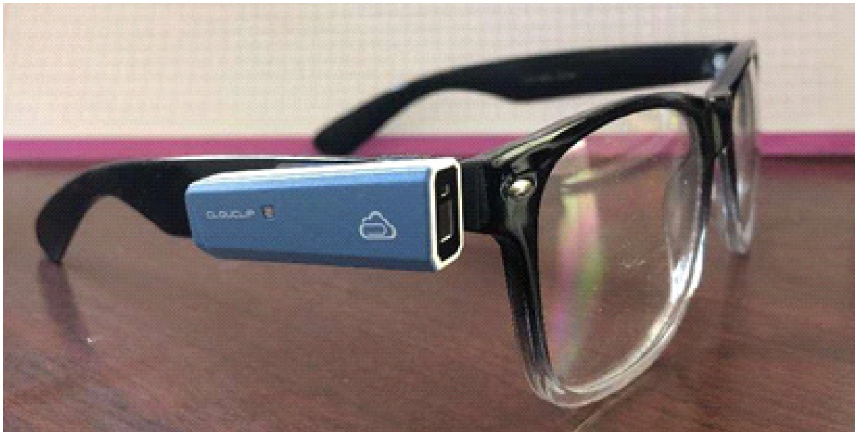
Figure 2. Clouclip attached to front, right temple of Plano glasses

week, the data from each device were transmitted via Bluetooth to the Clouclip Medical app on a smartphone (requires Android 4.4 or later, IOS 9.0 or later) and uploaded to a server provided by the Clouclip developer.