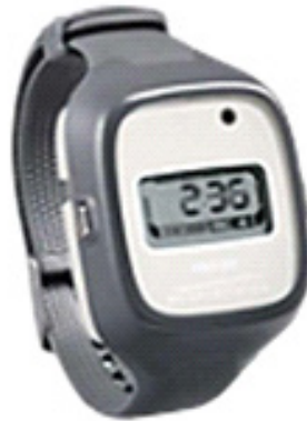
Figure 1. Actiwatch Spectrum Wristwatch; measures physical activity, light exposure, and sleep.

ambient light exposure and activity continuously at 32 Hz (Ostrin et al., 2018) and is commonly used in studies related to myopia, circadian rhythm, and sleep (Ostrin et al., 2018, Bélanger et al., 2013). The date and time are both displayed on the screen of the watch, and the device has a built-in “offwrist” detection system to monitor participant compliance. This device is equipped with three color light sensors to determine exposure to three color bands of the visible spectrum: red, green, and blue (Ostrin et al., 2018) in irradiance. The illuminance of white light is recorded in units of lux (range 0.1 to 200,000 lux), and the irradiance of the red, green, and blue spectral components are measured in \mu\text{W}/\text{cm}^2 (red channel: 400–500 nm, green channel: 500–600 nm, blue channel: 600–700 nm) (Ostrin et al., 2018). Minutes exposed to higher than 1000 lux were used as an approximation for time spent outdoors during the day (Ostrin et al., 2018).