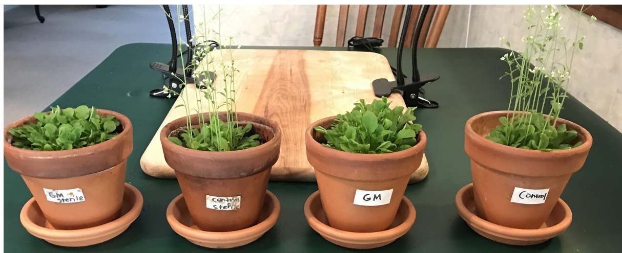
Figure 3. A. thaliana Growth Comparison

Growth rates in accordance with Figure 2 were gathered from the observed largest leaf size of each plant type as shown in Figure 3. This took place over a 4-week period and the leaves were measured every Sunday using a ruler. Figure 3 shows the final picture taken after week 4.