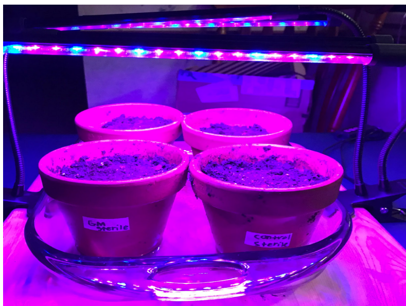
Figure 1. A. thaliana Growth Setup

First, seeds were planted on the top of 4.409 x 3.937 terracotta pots that contained moist soil, created from mixing in small amounts of water to the soil. Approximately 15 seeds were planted per pot to allow for an innumerable amount of leaves available for the method of photosynthetic flotation. Additionally, the pots were placed on a flat, or any surface that has a square bottom but rounded edges. This tool was used to allow for the absorption of water through the holes in the terracotta plants by the soil, providing hydration to the seeds. According to Chris Calhoun, the germplasm curator of the ABRC, A. thaliana does not typically do well when watering from the top of the plant and is hence why this technique was used. The flat was covered with water daily until the seeds began to sprout. Typically, this takes around 3-7 days to occur, but once complete, water was added every two days for a period of 15 minutes. Excess water was dumped after this time and the flat was kept dry until watering was needed. In terms of a light source for these plants, 2 LED growing lamps were used that each contained two necks. These necks held a purple light lamp that could be adjusted in intensity. A consistent setting was applied for each of the pots for a 16-hour photoperiod, or an interval of time in which plants were given light. The set up for the growth of A. thaliana can be seen in Figure 1.