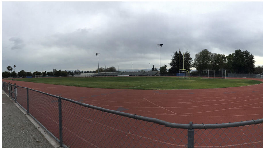
Figure 1. Setting for experimentation

Lastly, for consistency, the mean standard deviation of the eight 100-meter subjects ran by each subject was compared between treatment groups.